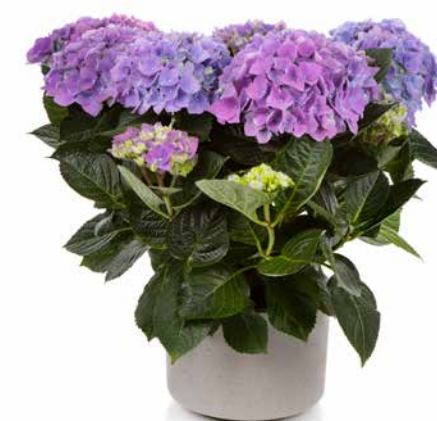
H I S K Y