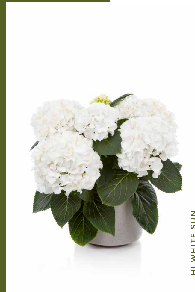
HI WHITE SUN